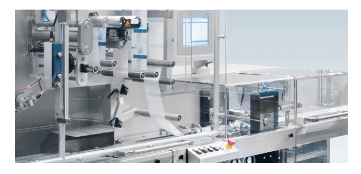
SR060E – Numerous applications in Flow Pack systems