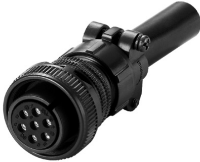
Female connector with coupling nut