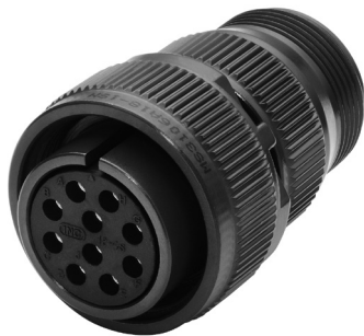
Female connector with coupling nut