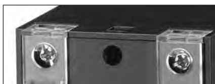
Art. No. T051.687 (2-pcs. per counter required)